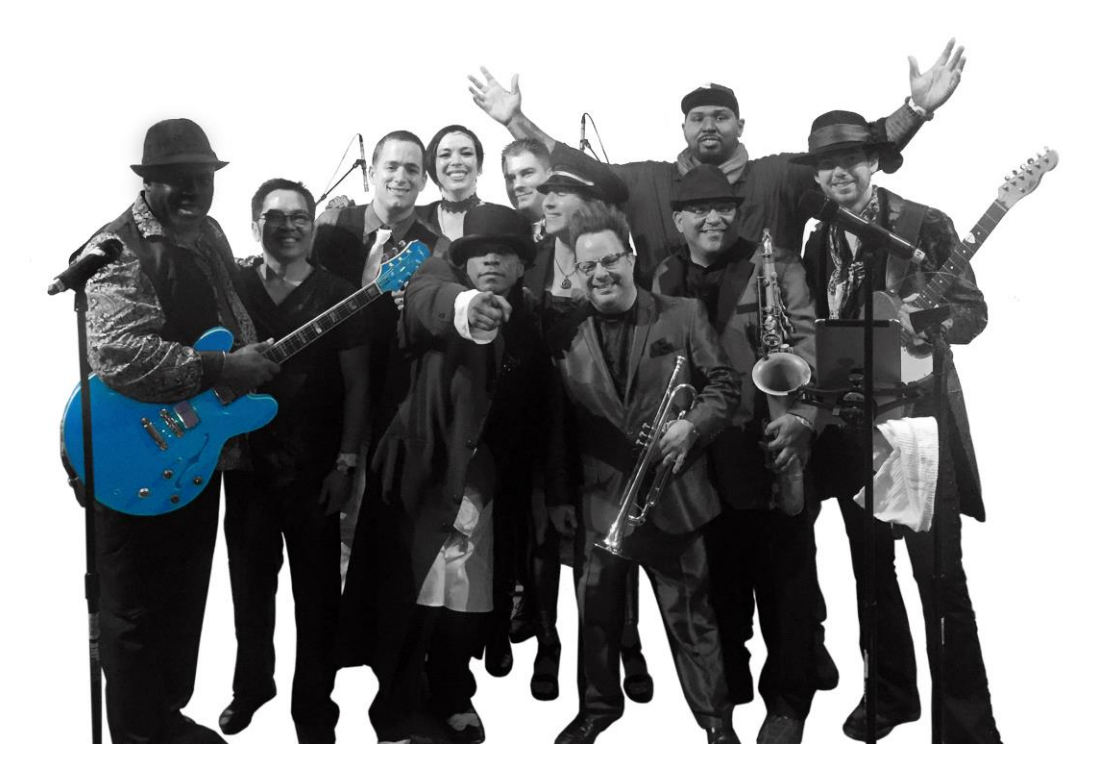
Airto Moreira with Eyedentity Featuring Diana Purim: